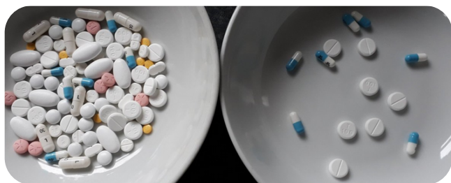
Deprescribing : before and after

To fill these gaps, the Canadian Medication Appropriateness and Deprescribing Network Health Care Provider Committee determined that an educational framework was needed